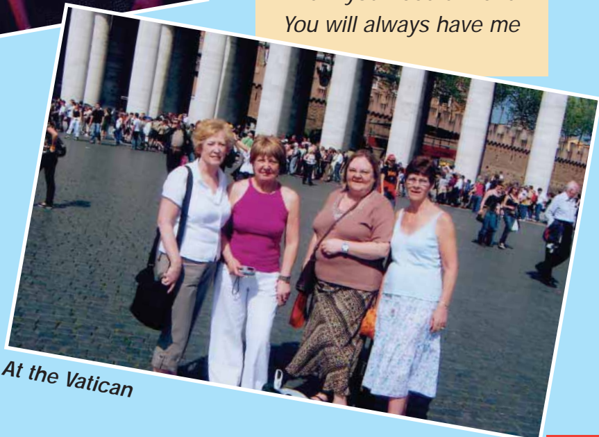
At the Vatican